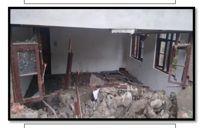
Debris in Class Room