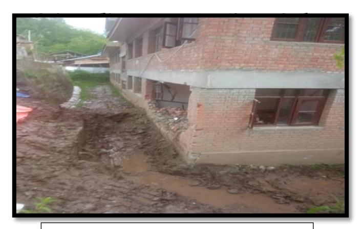
Damaged Portion of the Building

On 6th 0f May 2023 due to caving in of protection bund/ wall constructed by irrigation department just behind the school building at Iskenderpora Magam, a portion of school building suffered heavy damage as the concrete debris of wall rammed in one of the class rooms. Since it was heavily raining on the said date which in fact prompted the Lady Principal of the school to leave the students half an hour earlier than the actual school time otherwise anything untoward would have happened. Thanks to Almighty Allah and the Aima Masoomeen (a.s). President along of CEC with members team immediately visited the place and directed that the repairs of the be undertaken damaged wall priority. The District Administration also geared up ext{their} men machinery and assured the President