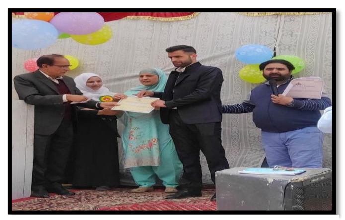
IPS Noorkhah 10<sup>th</sup> Class student selected & participated in National Level Junior Volley Ball Championship being felicitated by the President.