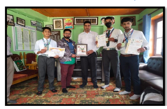
IPS Dab Federation Cup Yongmudo Championship 2023 won Gold Medals selected for National Level.