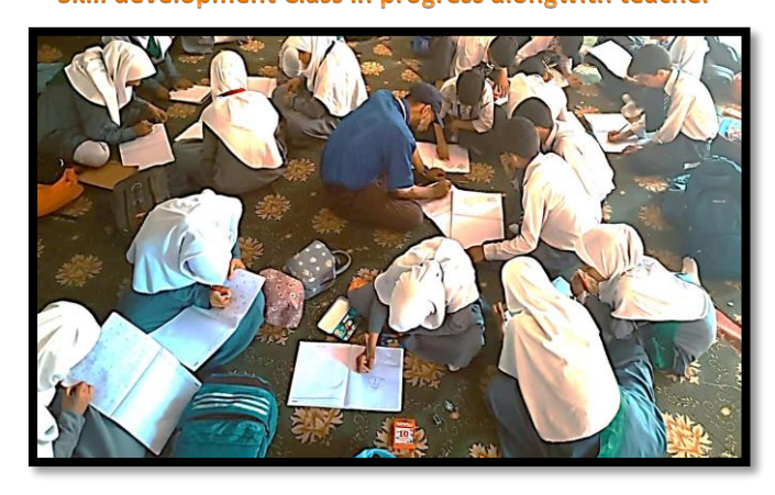
Skill development Class in progress alongwith teacher

In order to vocationalize the Educational system as per the quidelines of National Educational Policy (NEP) 2020. Educational trust Kashmir has initiated the process and at the first step Art classes/paper Machie skill has been started at IPS Meer Behri Srinagar which was inaugurated on 31 May 2023. Students of different classes have registered themselves for the said classes and showed keen interest in subject. A teacher has also been engaged for the purpose. The classes are going on regular basis. The local people have appreciated the initiative taken by the Educational Trust Kashmir.