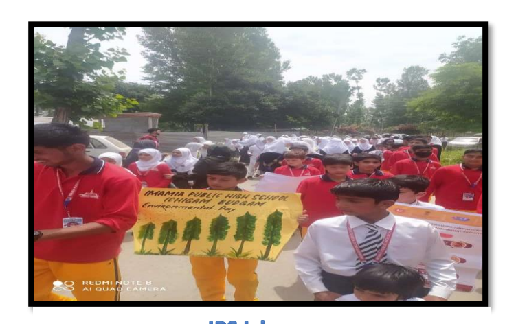
IPS Ichgam Environment Day Rally