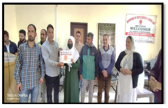
Painting competition IPS Watergam